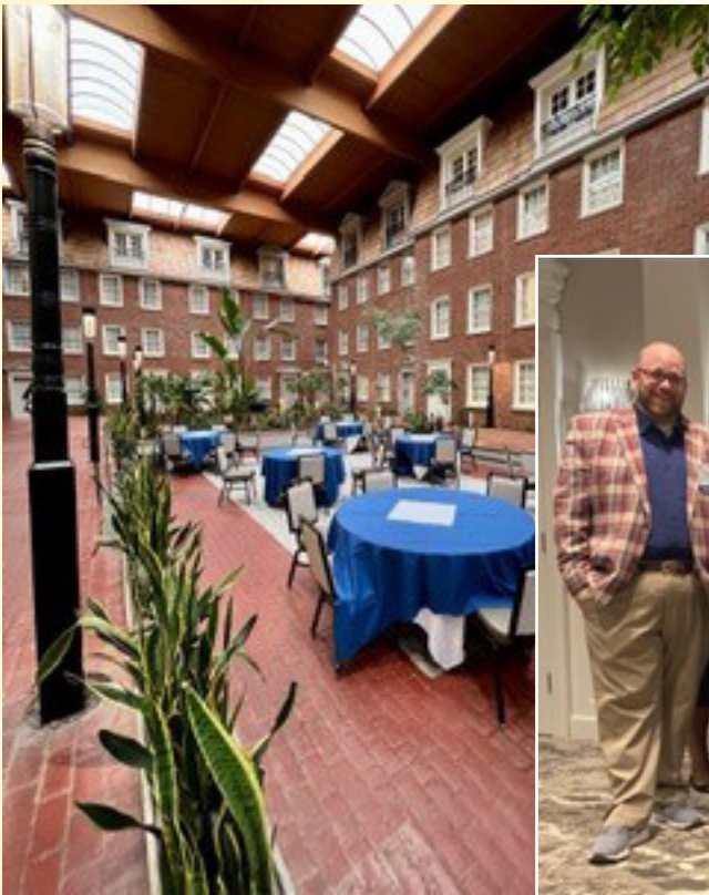
Desmond Hotel venue for conference