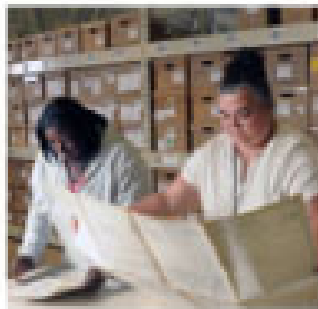
MASS SCANNING SERVICES