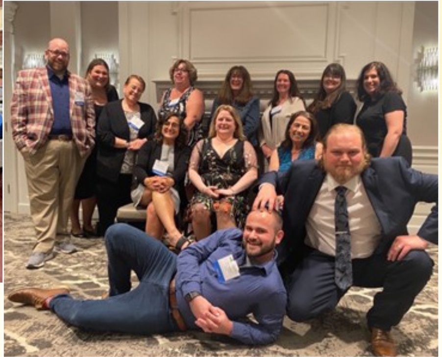
Getting ready for a group shot