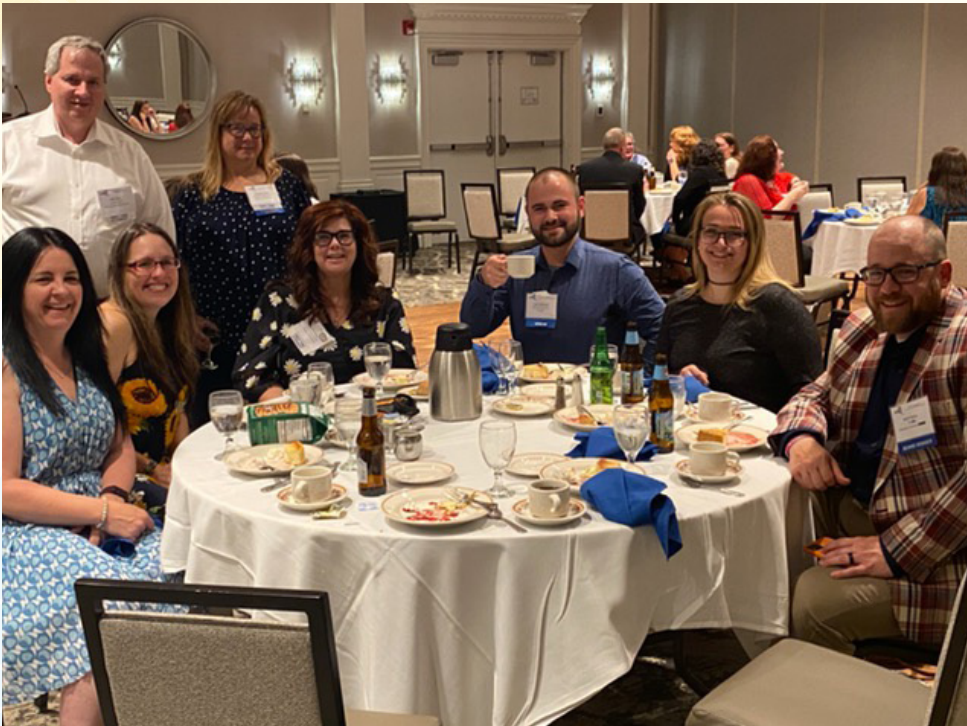
Enjoying the Banquet